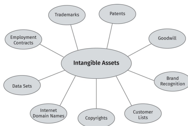
Fig. 1. Representative types of intangible assets.

Data value is determined by various factors such as data complexity, number of records in the data set, number of variables, and quality of the data. 25 Further, deidentified health records are less valuable because researchers need dates and geocodes to contextualize disease progression and co-morbidities. 26 In addition, data valuation is influenced by data perishability, which involves devaluation over time, and time-dependency, a measure of the time since data collection. 27 The use of blockchain also offers features that may increase data value. 28